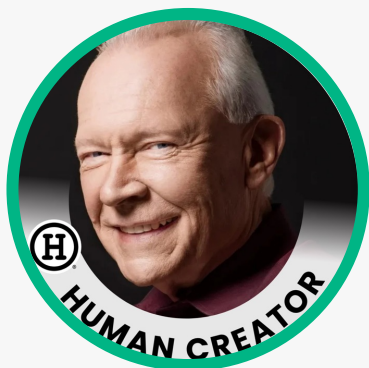
@ TERRY BROOKS, AUTHOR NY Times Bestselling Author Sword of Shannara series 25 million books sold